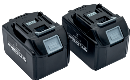
2 × 18 V Lithium-ion batteries (7,5 Ah)

The Richter VA2 features connected batteries that provide up to 90 minutes of continuous operation. The dual fast charger fully recharges the batteries in just one hour. The device's performance is adjustable between 150 and 300 Watts, allowing you to easily match the suction power to the type of flooring you would like to clean. The display on the unit constantly shows the current performance level and the remaining runtime in percentage.