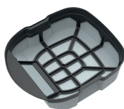
2. HEPA13 fleece filter basket (washable)