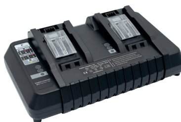
1 × quick charger