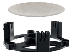
3. Motor protection filter