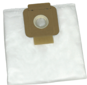
1. HEPA13 fleece filter bag

In addition to everyday applications (such as use on standard surfaces in apartments, houses, guesthouses, restaurants, hotels, and service businesses), the device is an ideal choice for allergy sufferers. It is perfectly suited for cleaning in hospitals, nursing homes, kindergartens, and for anyone who places special importance on hygienically pure air.